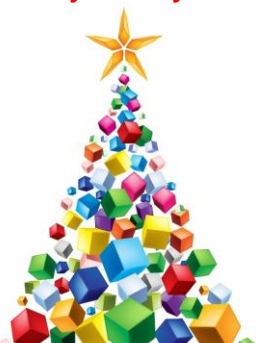
S J Scannell & Co Would like to wish you and your family a Merry Christmas and prosperous New Year

We advise our offices will be closing on Wednesday, 23<sup>rd</sup> December 2014 and re-opening on Monday, 12<sup>th</sup> January 2015 at 8.30 am